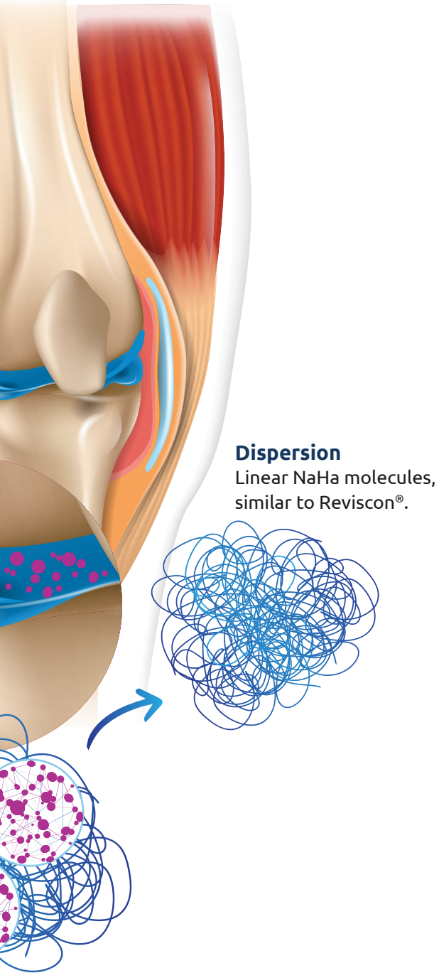
Dispersion Linear NaHa molecules, similar to Reviscon®.